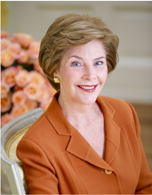
Laura Lane Welch Bush November 4, 1946 Wife of President George W. Bush