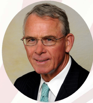
Francis Rooney U.S. Congressman Dist. 19