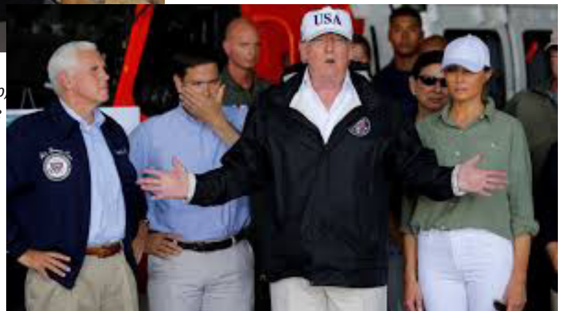
Vice President Pence, Marco Rubio, President Trump and First Lady Melania Trump all showed up along with the Governor who is not pictured.